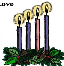
Fourth Sunday in Advent