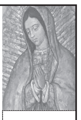
Hail Mary, Full of Grace! Holy Mary, Mother of God!

Missions: Des Moines, Folsom, Moses, NENM Detention Facility