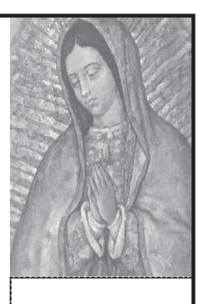
Hail Mary, Full of Grace! Holy Mary, Mother of God!

Missions: Des Moines, Folsom, Moses, NENM Detention Facility