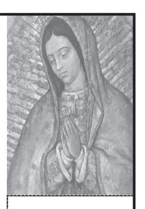
Hail Mary, Full of Grace! Holy Mary, Mother of God!

Missions: Des Moines, Folsom, Moses, NENM Detention Facility