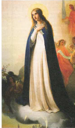
THE ASSUMPTION OF THE VIRGIN MARY, PAVIA CATHEDRAL

From Catholic and Cornered: Answers to Common Questions About Your Faith , © 2011 Liguori Publications