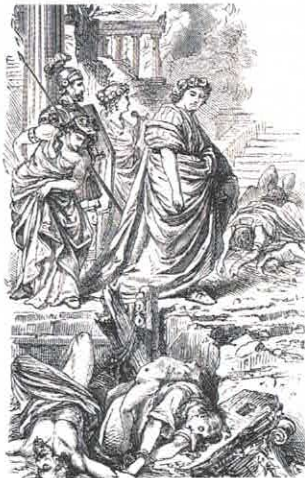
ROMAN EMPEROR NERO, LEFT, FROM “HISTORY OF THE CHURCH,” AROUND 1880